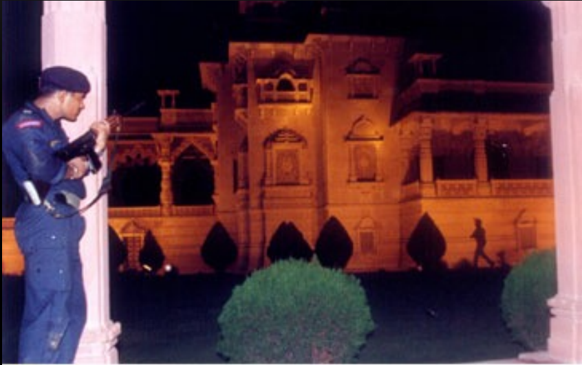
Attack on Akshardham Temple in Sept 2002