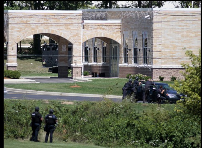
Attack on Sikh Temple in Wisconsin