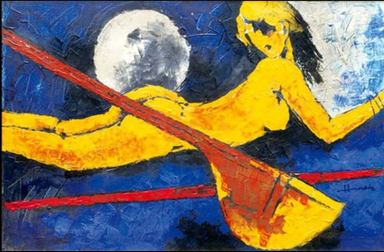
Painting of Saraswati Devi by MF Hussain